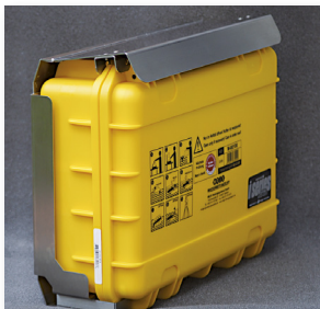
Mounting bracket Stainless steel, rust-free